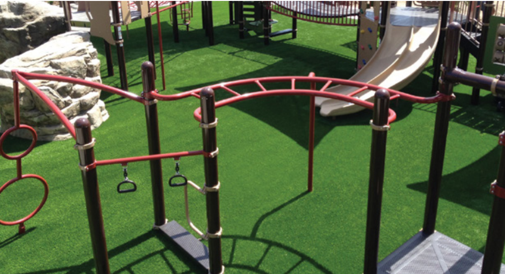
Surface America® PlayBound™ TurfTop™ at Los Olivos Park in Irvine, CA