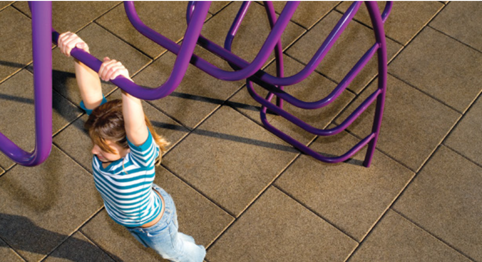
Surface America® UltraTile® Play under play equipment at park playground