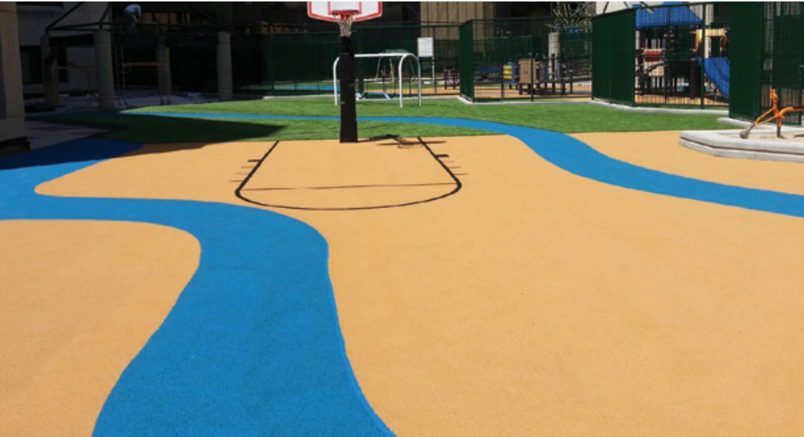
Surface America® EverTop™ at Papa John Hospital in Iowa City, IA