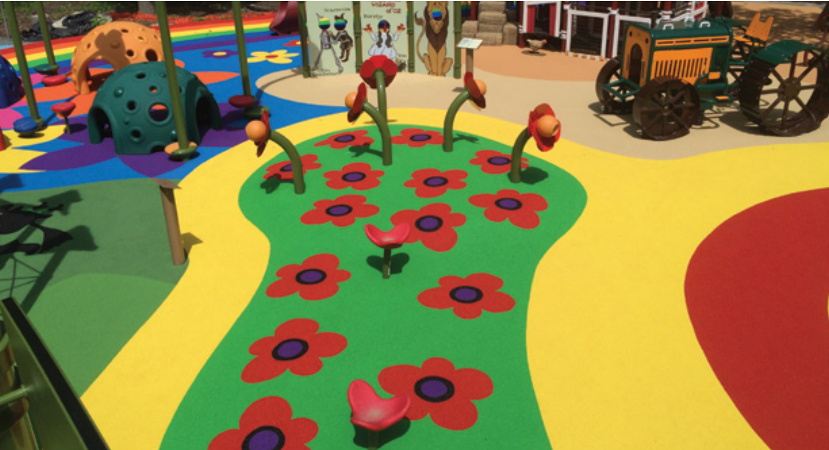
Surface America® PlayBound™ Poured-in-Place at Watkins Regional Park in Upper Marlboro, MD